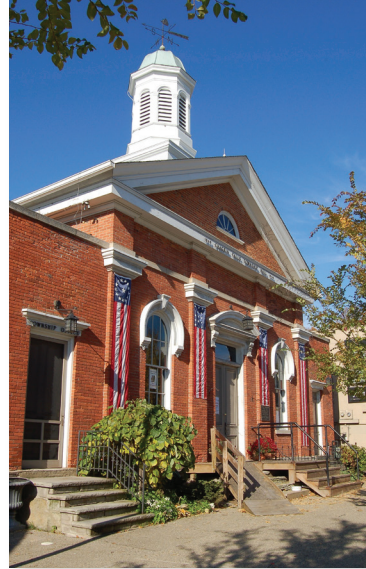
resides on top of the roof today.